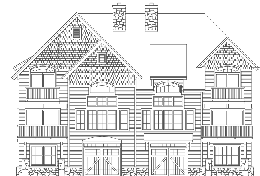
PROPOSED SOUTH (VIEW) BUILDING ELEVATION