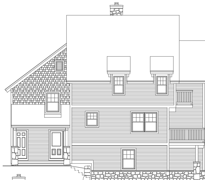
PROPOSED WEST BUILDING ELEVATION